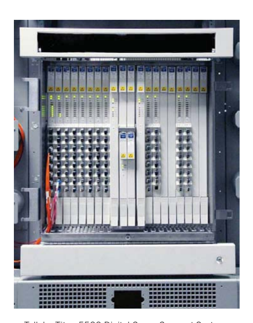
Tellabs Titan 5500 Digital Cross-Connect System Consolidated Core Switch (CCS) Shelf