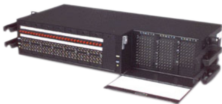
32-termination front cross-connect panel Telect part number 010-0132-0101