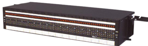
64-termination rear cross-connect panel Telect part number 010-2164-1003