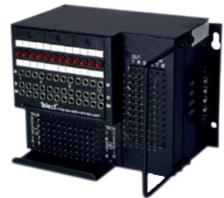
12-term. wall-mount panel Telect part number 010-5012-0001

teammcauliffe@picstelecom.com | TELECOMCAULIFFE.com | office: 585.785.5472 | cell: 585.746.6383