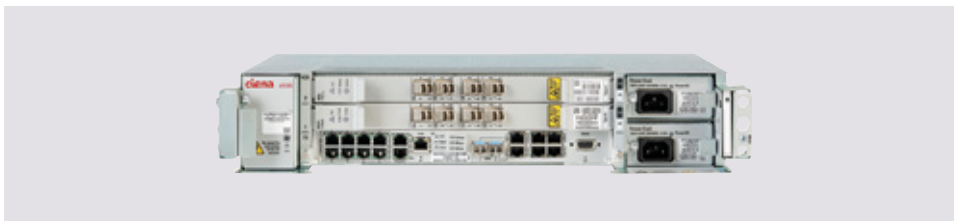
6500-D2 amplifier configuration

The flexibility of the 6500 platform starts with the variety of services it can deliver over a wide range of applications. A handful of interfaces support the full mix of Ethernet, OTN, SDH/SONET, Fibre Channel, video, and transparent DWDM services—from DS1/E1 to 100 GbE/OTU4 to 400GbE—for efficient service transport from the edge to the core and across submarine applications. Standards-based service interfaces ensure seamless multi-vendor interoperability.