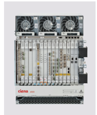
6500-D14 transponder/muxponder configuration