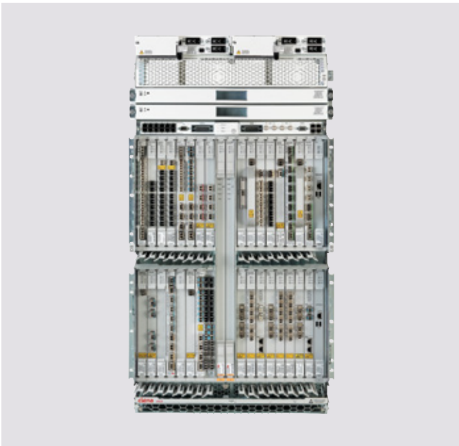
6500-S32 Packet/OTN switching configuration

as a full OTN or native packet switch with no capacity or functionality constraints. Alternatively, operators can offer a mix of both; for example, an operator offering OTN-switched services can introduce co-resident packet-switched services for new revenue streams.