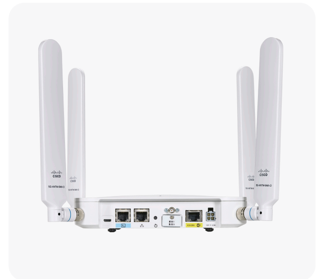
Figure 2. Port Density in the Cisco Cellular Gateway