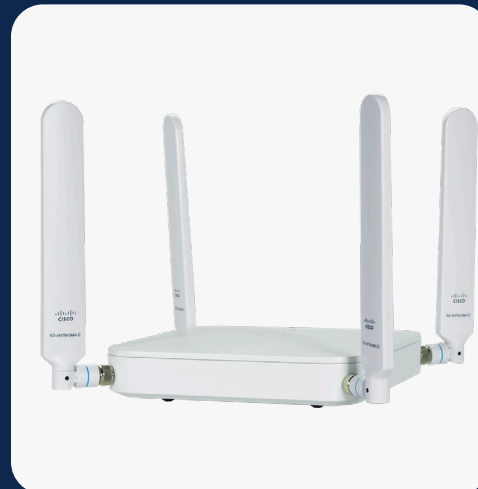
Figure 1. The Cisco Catalyst Cellular Gateway

Over the last 10 years, we've seen the evolution of 4G. First LTE, then LTE Advanced and LTE Advanced Pro. And now 5G. The higher throughput and lower latency of 5G means increased workforce productivity and a better user experience. Now you can support more users in more locations, using cellular to offer wireless connectivity with wider reach. The ability to support new applications and connect more devices makes it easier to migrate to a wireless WAN (WWAN) with guaranteed quality of experience. Cisco is working to make the transition to 5G easy by building technologies such as the Cisco® Catalyst® Cellular Gateways that allow for a seamless cellular upgrade.