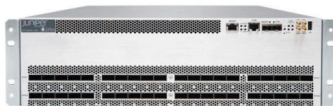
PTX10003-80C Packet Transport Router