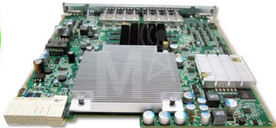
Total Access 5000 GPON Octal OLT (1:64 Split)