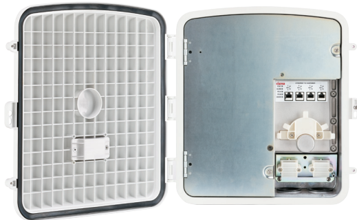
Figure 1. 3931 interior view

As bandwidth demands continue to grow exponentially, particularly for mobile backhaul applications, the 3931 provides the ability to deploy with 1G backhaul today and simply swap transceivers to upgrade to 10G when the rest of the network is ready. Readiness for LTE and future mobile backhaul needs are not compromised. The 3931 features a high-capacity switching fabric, 2 NNI SFP+ ports that support 1GbE or 10GbE, 4 100/1000M SFP UNI ports, and 4 10/100/1000 RJ-45 UNI ports.