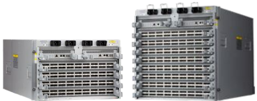
Arista 7500E Series Modular Data Center Switches

With front-to-rear airflow, redundant and hot swappable supervisor, power, fabric and cooling modules the system is purpose built for data centers. The 7500E Series is energy efficient with typical power consumption of under 4 watts per port for a fully loaded chassis. All of these attributes make the Arista 7500E an ideal platform for building reliable, low latency, resilient and highly scalable data center networks.