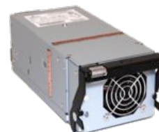
Arista 7500 Series Power Supply