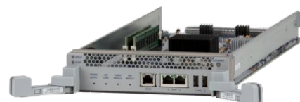
Arista 7500 Series Supervisor