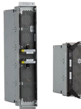
Arista 7500 Series Fabric Modules