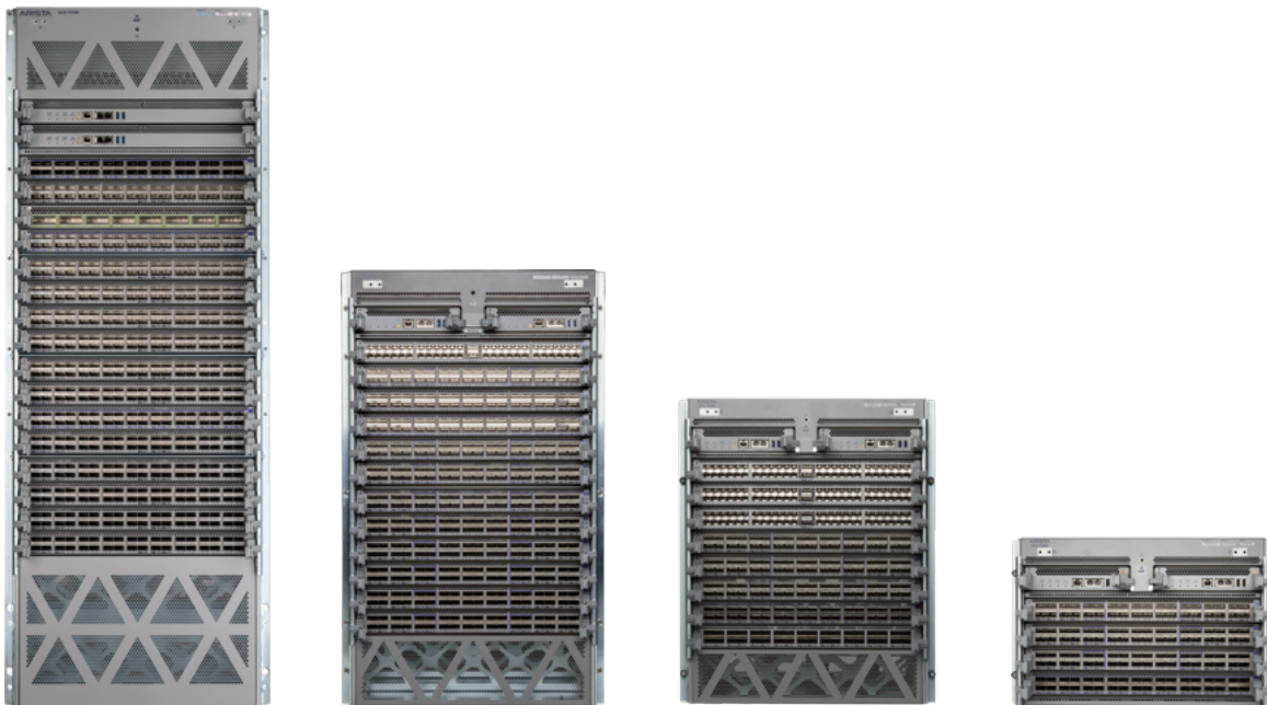
Arista 7500R Series Chassis (left to right) - 7516R, 7512R, 7508R and 7504R

The 7500R Series chassis each provide room for two supervisor modules, four, eight, twelve or sixteen line card modules, grid redundant power supply modules, and six fabric modules. Supervisor and line card modules plug in from the front, while the fabric modules and power supplies are inserted from the rear. The system uses a completely passive midplane and provides control plane connectivity to each of the fabric and line card modules. The system design is optimized for data center deployments with front-to-rear airflow.