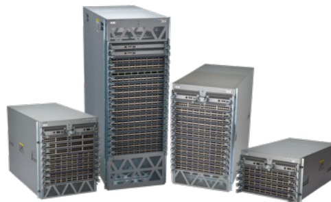
Arista 7500R Series Modular Data Center Switches

All components are hot swappable, with redundant supervisor, power, fabric and cooling modules with front-to-rear airflow. The system is purpose built for data centers and is energy efficient with typical power consumption of under 25 watts per 100GbE port for a fully configured chassis. These attributes make the Arista 7500R an ideal platform for building reliable and highly scalable data center networks.